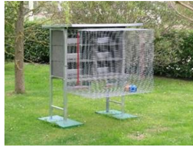
Aviary for Pigeons 6 pair

Dear Customer, Thank you for purchasing a FERRANTI product.