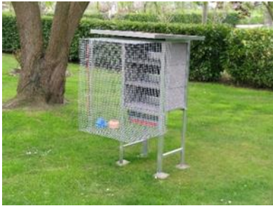
Aviary for Pigeons 3 pair