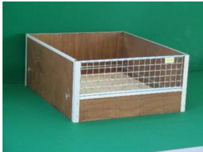
Whelping Box in wood for dogs