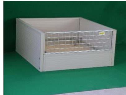
Whelping Box for dogs in insulated panels

Dear Customer, Thank you for purchasing a FERRANTI product.